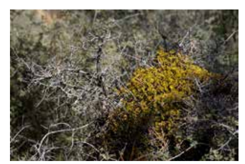
Fig. 3: Mistletoe on scrub oak

age to houses here in our mountains (Fig. 4). They don't mean to be harmful. They simply are storing acorns for later use (Fig. 5). They are absolutely dependent on several species of oak. They return the favor by accidentally dropping acorns well away from the oak tree. Acorns are heavy and will drop straight