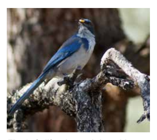
Fig. 6: California scrub-jay with a pine nut

systems of several bush species, in this case, probably the sagebrush. It generally does not hurt the host very much. (Fig. 10) displays the penstemon again, this time in association with a pollinating na-