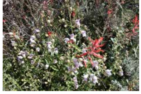
Fig. 9: Paint brush, Grinnell's penstemon and sagebrush

These are just a few examples of the complexity of the natural world around us. Do go outside and enjoy these wonders.