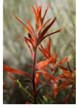
Fig. 8: Paintbrush

tive bumble bee. Here, the flower feeds the bumble bee nectar (sugar) and pollen (protein), while the bee carries fertilizing pollen from one flower to another. So, we have two relationships between these three plants and one insect. Maybe more