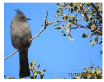
Fig. 2: Female phainopepla on scrub oak

Phainopepla/mistletoe: An interesting bird that is found locally, but can be difficult to glimpse, is the phainopepla. It looks like a black cardinal with