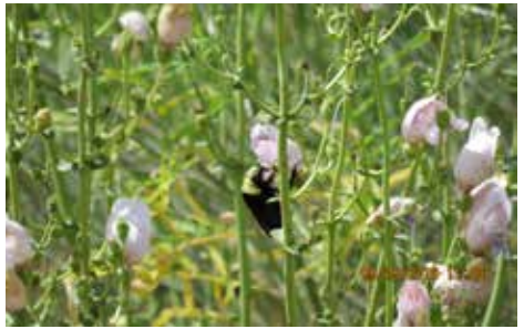
Fig. 10: Grinnell's penstemon with a California bumble bee