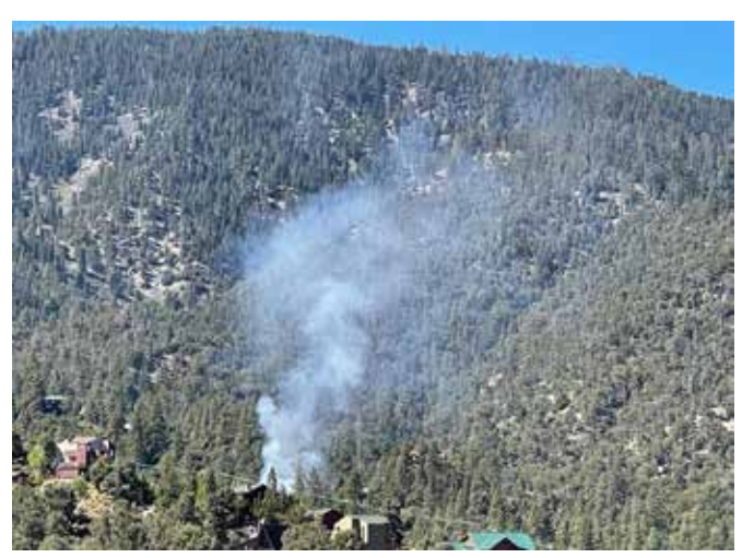
On Sept. 7, 2021, PMC had a fire in the greenbelt between Bernina and Zion. This fire served as a reminder that the potential exists. Fire season is nearly year-round now. Thankfully, it was not windy, the temperature was mild and humidity was up a bit that day. The Fire Department was able to extinguish the fire quickly. Please be careful and be prepared!

The only OFFICIAL PMCPOA Facebook page can be accessed at: https://www.facebook.com/pmcpoa