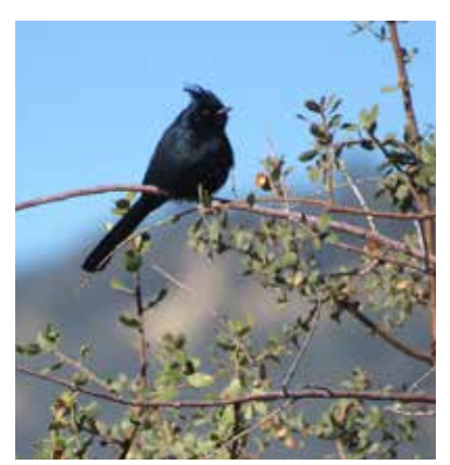
Fig. 1: Male phainopepla on scrub oak

Those of us who enjoy nature tend to think of different plants and animals as discreet entities. As we walk the trails, we note the cottontail bunny, the bluebird, various flowers, different species of trees. However, there is much going on that brings these different organisms into meaningful contact with each other. One