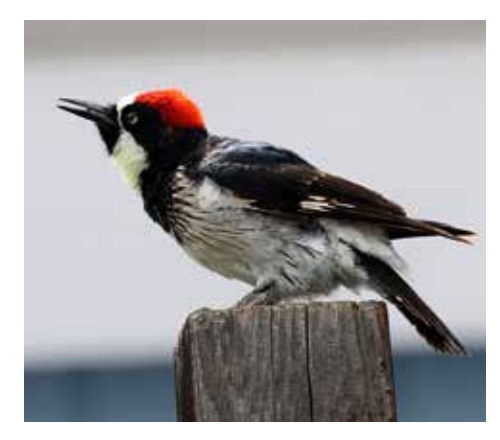
Fig. 4: Acorn woodpecker

Jays/pinyon pine: For another example of bird and tree helping one another,