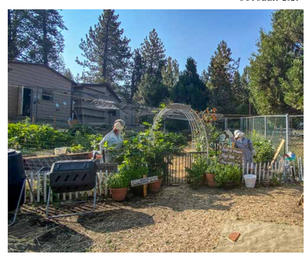
The Pine Mountain Gardeners have been busy working and growing in the local garden, and will soon have a harvest dinner.

If you have a new post office box or phone number, please call the office at 242-3688 to update your account. If you use the website, the office may not receive the information for a while because the site does not automatically notify the office that a change has been made. Please call us or stop by to let us know so that we will have your up-to-date information right away.