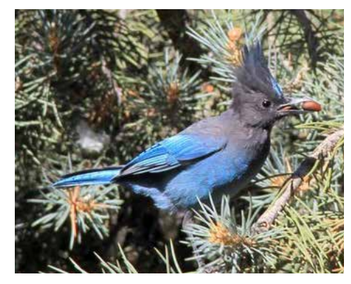
Fig. 7: Steller's jay in a pinyon pine with a pine nut.

tive bumble bee. Here, the flower feeds the bumble bee nectar (sugar) and pollen (protein), while the bee carries fertilizing pollen from one flower to another. So, we have two relationships between these three plants and one insect. Maybe more