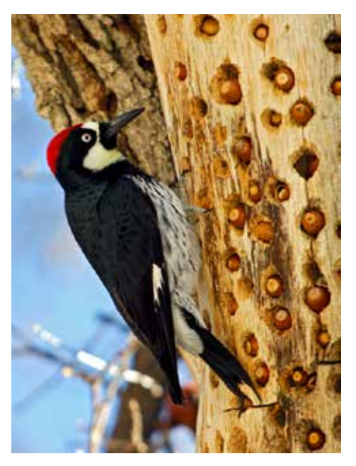
Fig. 5: Acorn woodpecker with its acorn cache.

Paintbrush/sagebrush/penstemon: (Fig. 8) shows paintbrush, an attractive flower in our open woods. (Fig, 9) includes three plants, the paintbrush, the blue Grinnell's penstemon and the gray foliage of sagebrush. Paintbrush is a partially dependent parasite on the root