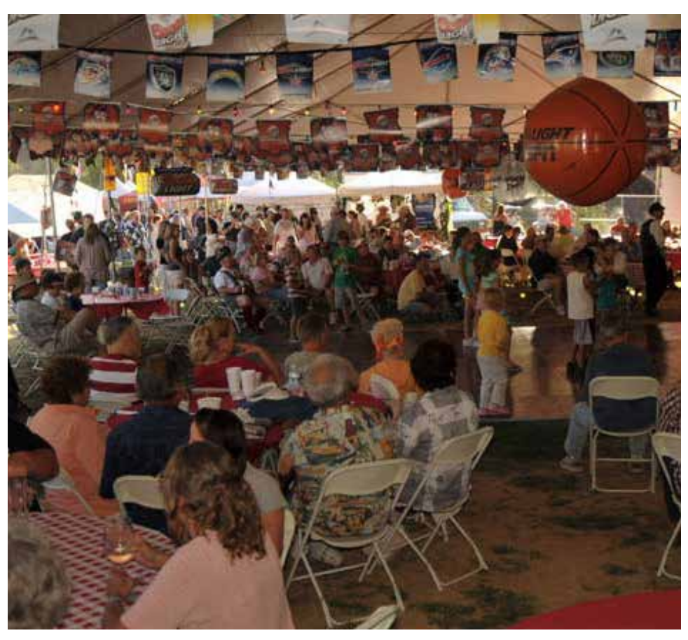
The annual PMC Oktoberfest drew large and lively crowds for many years.

By 2013, the Fall Festival had run its course, and with it ended a long tradition for Pine Mountain Club.