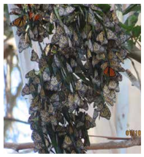
Fig. 7: A wintering swarm of adult Monarchs on a tree near the coast

the butterflies return to the same groves of trees. The caterpillars (Fig. 8) require leaves of various species of milkweed.