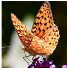
Fig. 4: Variegated Fritillary

quently do not Fig. 3: Red Admiral appreciate stinging nettle because of its irritating leaf hairs, but this butterfly certainly does. PMC's wetlands are loaded with stinging nettle, so we are blessed with this species. Red Admiral males are quite terri-