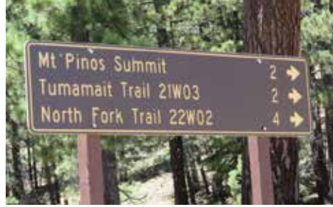
Fig. 12: Vincent Tumamait Trail sign -Mt. Pinos (BB).