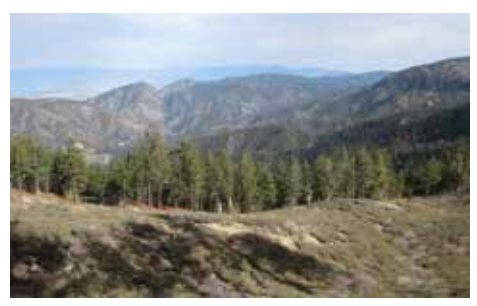
Fig. 13: PMC sits in the mountain valley northeast of Cerro Noroeste (ES).