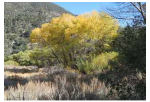
Fig. 10: The Mil Potrero Wetlands are very unusual for Southern California (BB).

tion on other dirt roads and trails penetrating our wild country can be found at the Chuchupate Ranger Station of