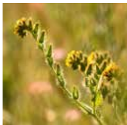
Figure 3: Fiddlenecks