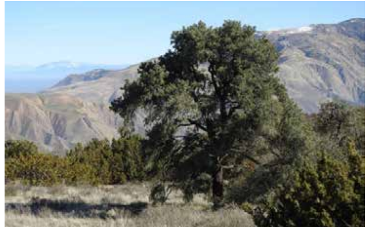
The upper half of HRR passes through pinyon pine, juniper and scrub oak.