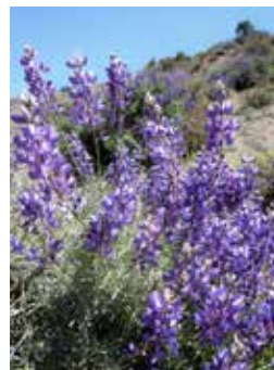
Figure 4: Lupine