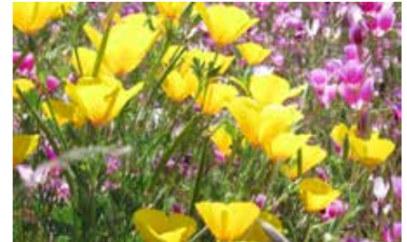
Figure 5: Poppies