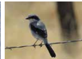
Figure 9: Loggerhead shrike