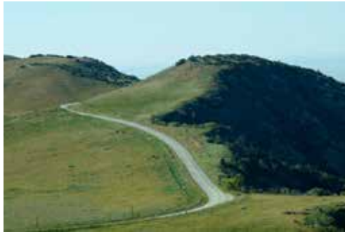
Figure 2: The lower half of HRR passes through grass-covered slopes.

One last item to mention is that there is a small primitive Forest Service campground, Valle Vista, about halfway along HRR. It provides an incredible view of the San Joaquin Valley, and makes a pleasant lunch stop. The dirt road leading into the camp is narrow, steep and easy to miss. If our local world of nature interests you, do take time to leisurely enjoy this country.