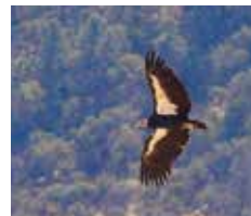
Figure 8: CA Condor (right)