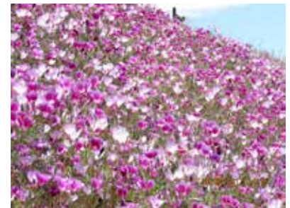
Figure 6: Farewell-to-spring