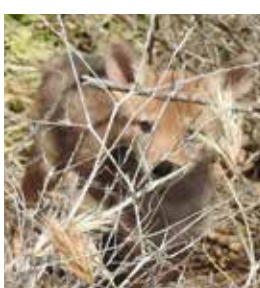
few individuals kit fox eyes the have been seen photographer (LB)

Another animal that occupies forests that are left over from the last ice age is the northern goshawk. This is a large predator of large birds, such Fig. 4: This as grouse. Very camouflaged