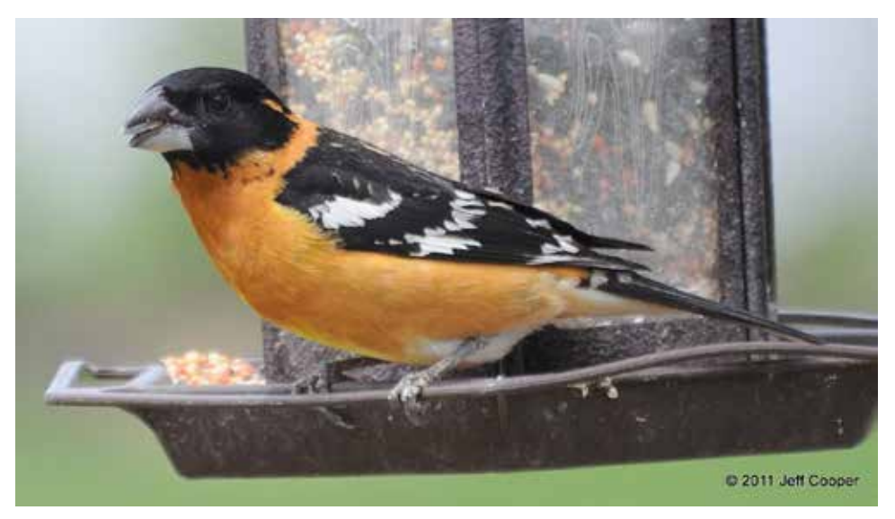
A Grosbeak at a feeder.