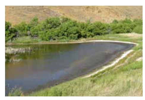
Fig. 6: The Gorman Sag Pond has water only seasonally (BB)

The kit fox eats similar prey to that eaten by the gray fox, which is found in and