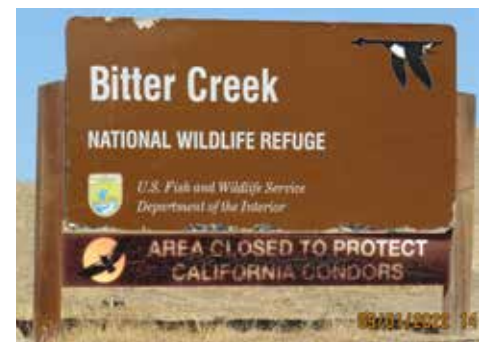
Fig. 10: Bitter Creek National Wildlife Refuge monitors and aids our local Condor population (BB)

Our mountainous region remains a refuge for many animals and plants that are threatened by modern human civilization. This is an area where people are still able to live alongside many wild creatures in their natural habitats.