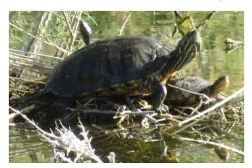
Fig. 7: These western pond turtles are active only when water is present (BB)

around PMC. The kit fox does well in very dry conditions. The kit fox in this photo is hard to see as it hides at the opening of a culvert near Bitter Creek National Wildlife