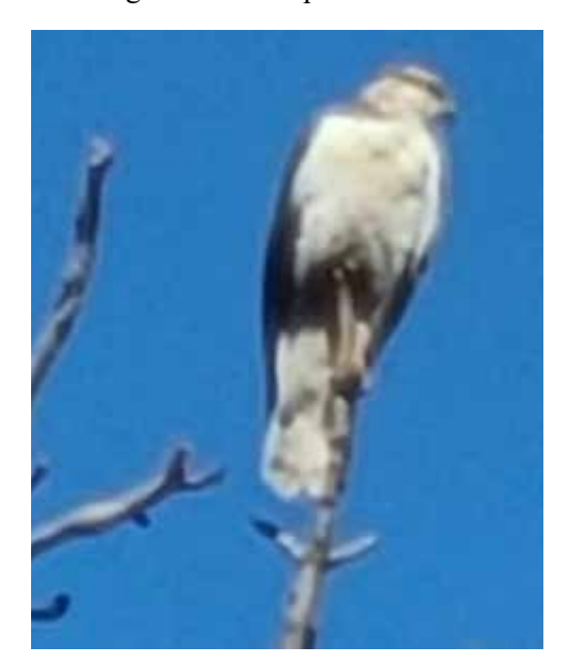
Fig.3: The goshawk favors our highest undisturbed forests (BC)

homes. The second chipmunk, the Mt. Pinos Lodgepole chipmunk (Fig. 1), is very localized. There are remnant populations only on our highest local mountains and in one other Southern California mountain range. This little pale-colored rodent