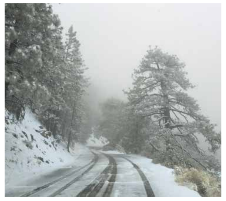
Weather can change very quickly in the mountains, and so can road conditions. Plowing is implemented as soon as possible.

When crews are available to begin berm removal, they will fol-