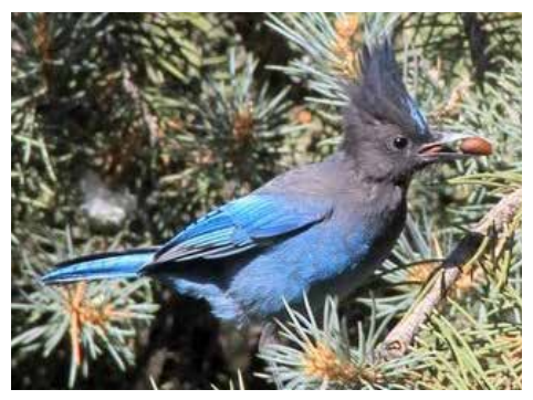
Fig. 2: This Steller's jay is collecting pinyon pine nuts for its future food supply (MAR).

Trees also provide nesting sites for many of our local animals. The gray squirrel often builds nests in oak trees where it also finds acorns to store and eat. A squirrel will use interconnecting tree branches as highways for its daytime travels through its territory (Fig. 8). It usually feels safest