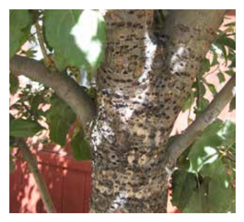
Fig. 7: These horizontal rows of small holes will supply a sapsucker with sap and insects (LS).