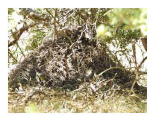
Fig. 9: This wood rat nest is secured by oak branches touching the ground (LB).