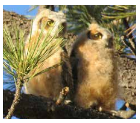
Fig. 11: These great horned owl youngsters were raised in a pine next to Askin Drive (BB).