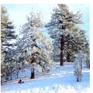
Fig. 1: Trees in a natural setting are part of a complex interconnected ecosystem (LB).

Residents in Pine Mountain Club are very much aware of trees. Forests are all around us (Fig. 1). Just who are these trees? Scientists are beginning to realize that being a tree is much more complicated than formerly thought. Recent studies have shown that trees are aware of each other, and they can communicate and share resources. They pass on alarms about beetle attacks; they