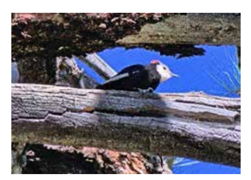
Fig. 10: A white-headed woodpecker uses a dead tree (snag) both for nesting and food source (RC).