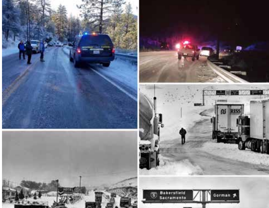
Winter driving can cause a lot of dangerous scenarios.

The Mountain Communities Family Resource Center has put together a survey to acquire input from locals to help the Center staff understand the needs of our community. They would like the survey to be completed by Dec. 31. Send it to the address in Lebec listed at the end of the survey, or go online at http://www.cstesurvey.org/EpilnfoWebSurvey/Home/cf92214e-846a-47ce-a76a-282a89d3cef5 to take the survey.