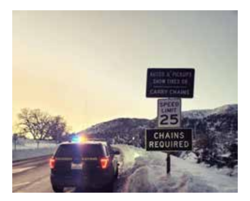
'WINTER' Continued from page 1